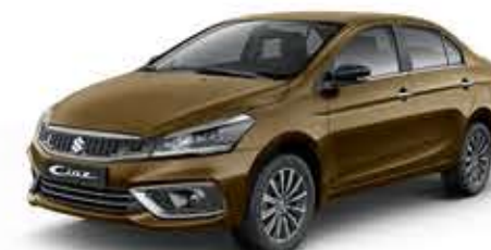
DIGNITY BROWN PEARL METALLIC (ZQK)