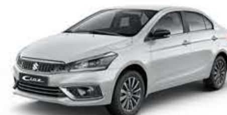
SNOW WHITE PEARL 3 (ZQM)