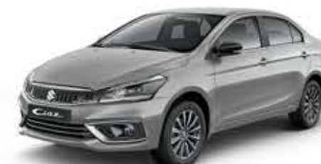
PREMIUM SILVER METALLIC 4 (Z2P)