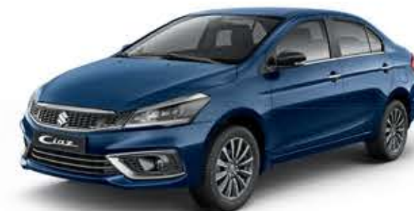
STARGAZE BLUE PEARL METALLIC (ZYR)