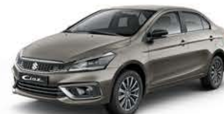
MAGMA GRAY METALLIC (Z7Q)