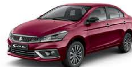
SANGRIA RED PEARL (ZQL)