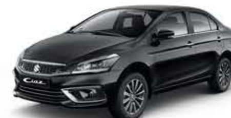
MIDNIGHT BLACK PEARL (ZAM)