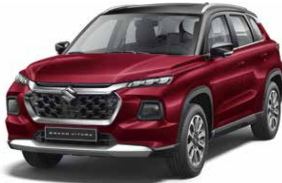
Opulent Red Pearl Metallic