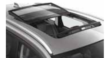
Front panel tilted up