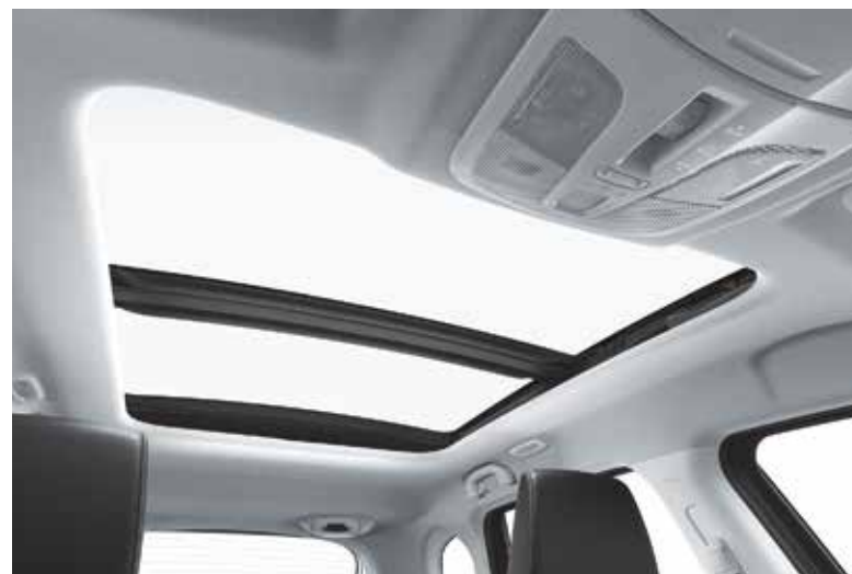
Rear panel slides into roof

The panoramic sunroof lets you experience refreshing open-air drives. Its double sliding glass panels create one of the biggest openings in its class and can be enjoyed from any seat in the car.