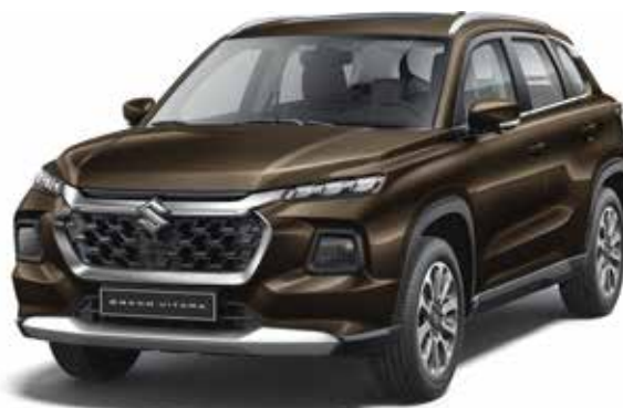
Cave Black Pearl