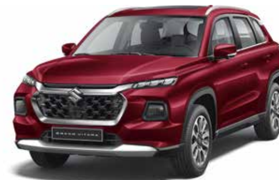
Opulent Red Pearl Metallic