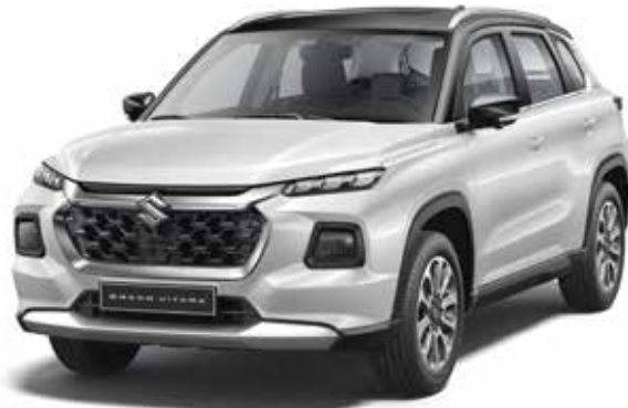
Arctic White Pearl