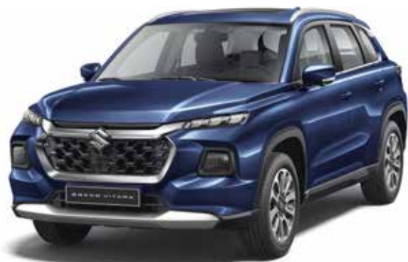
Celestial Blue Pearl Metallic