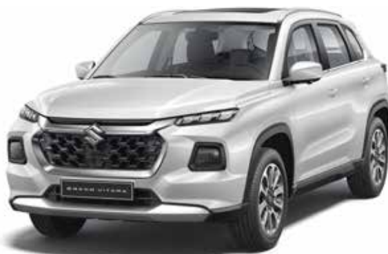
Arctic White Pearl