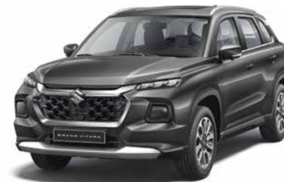
Grandeur Grey Pearl Metallic