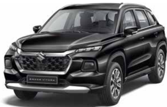
Midnight Black Pearl