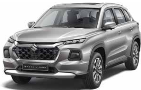
Splendid Silver Pearl Metallic