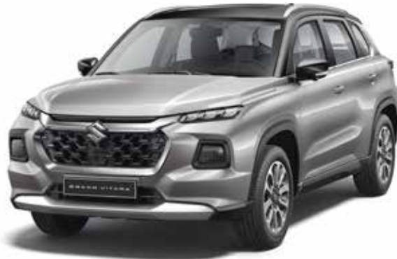
Splendid Silver Pearl Metallic