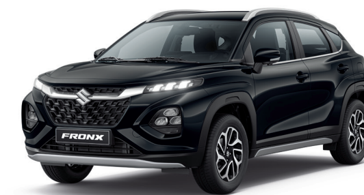
Bluish Black Pearl (WB3)