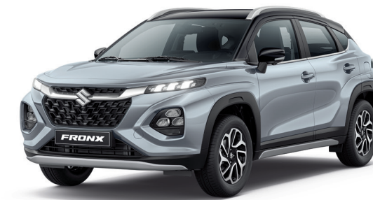
Splendid Silver Pearl Metallic x Bluish Black Pearl (E85)