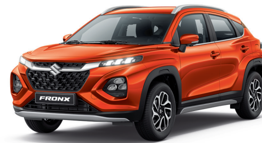
Lucent Orange Pearl Metallic (ZYE)