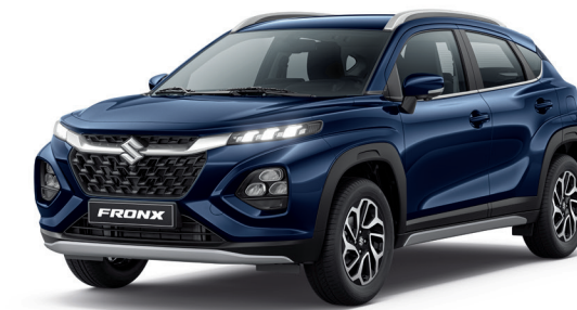
Celestial Blue Pearl Metallic (WBH)