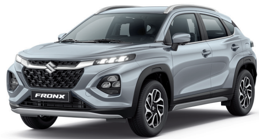
Splendid Silver Pearl Metallic (WBE)