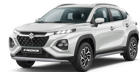
Arctic White Pearl (ZHJ)