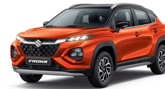
Lucent Orange Pearl Metallic x Bluish Black Pearl (E88)