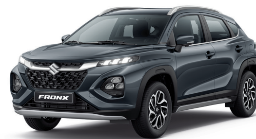
Grandeur Grey Pearl Metallic (WBF)