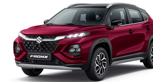
Opulent Red Pearl Metallic x Bluish Black Pearl (E86)