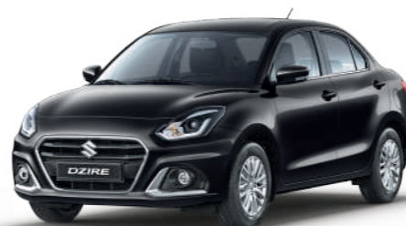
Midnight Black Pearl