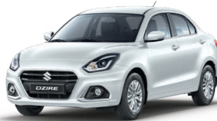
Arctic White Pearl