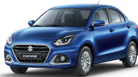
Oxford Blue Pearl Metallic