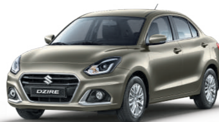
Sherwood Brown Pearl Metallic