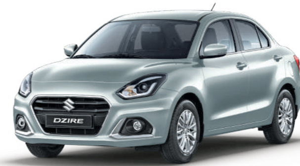
Premium Silver Metallic