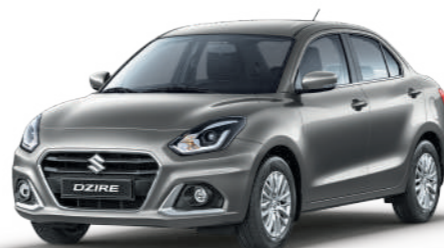
Magma Gray Metallic