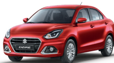
Phoenix Red Pearl