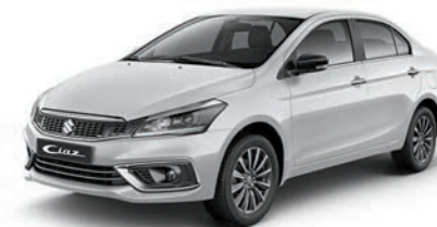
ARCTIC WHITE PEARL