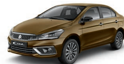
DIGNITY BROWN PEARL METALLIC