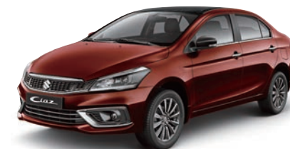
OPULENT RED PEARL METALLIC + MIDNIGHT BLACK