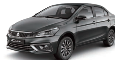
GRANDEUR GRAY PEARL METALLIC + MIDNIGHT BLACK