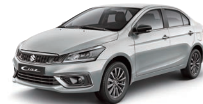
SPLENDID SILVER PEARL METALLIC