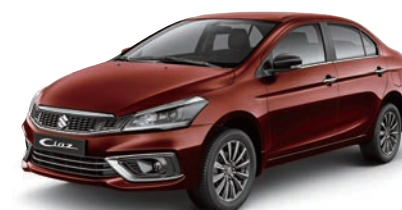
OPULENT RED PEARL METALLIC