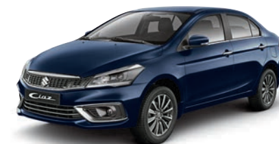
CELESTIAL BLUE PEARL METALLIC