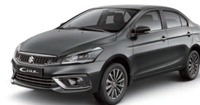
GRANDEUR GRAY PEARL METALLIC