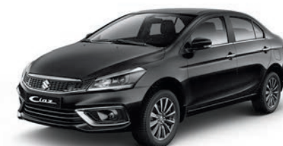
MIDNIGHT BLACK PEARL